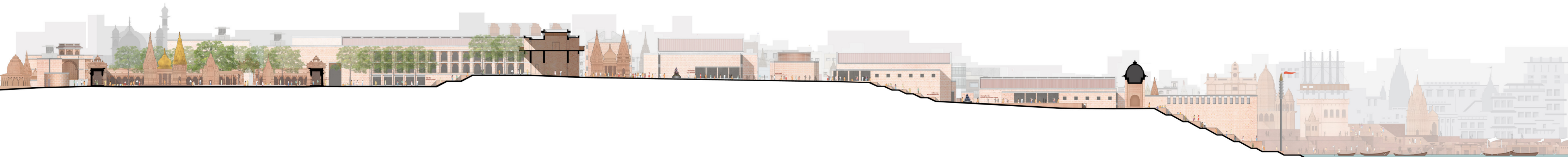
Shri Kashi Vishwanath Mandir